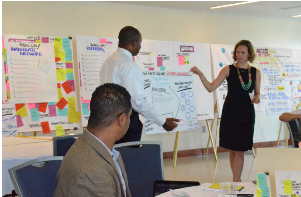
Table groups presented back regarding the significance of addressing their chosen challenge and the most important action steps the group can take to overcome it.